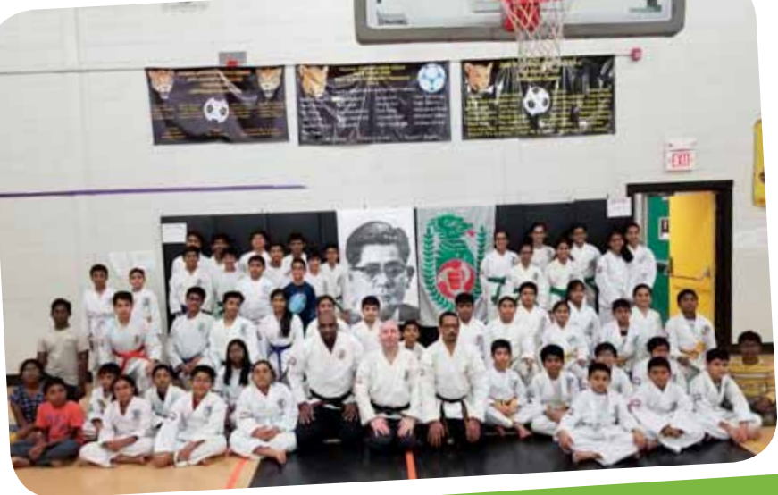
Spot the person in the front row with no facial hair